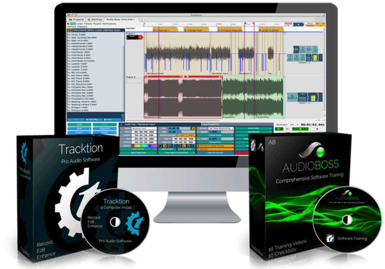
Pro Audio Software & Comprehensive Software Training